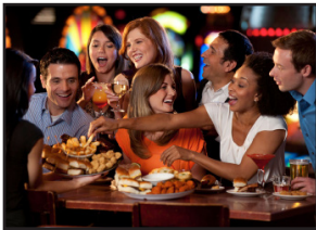
Dave & Buster's