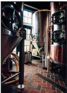
Flossmoor Station Restaurant & Brewery