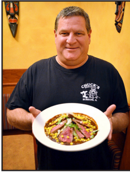
Chuck's Southern Comforts Cafe